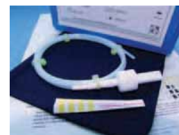
Bowie & Dick PCD