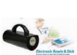
Bowie & Dick Electronic