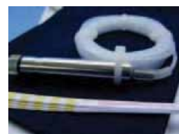
Bowie & Dick Stainless Steel