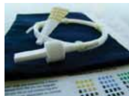
Lot/Batch Control PCD