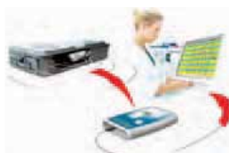
Electronic Probe Transmits through pack