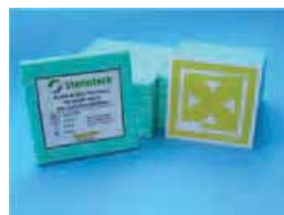
Bowie & Dick Pack