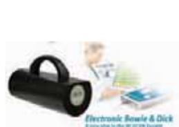
Bowie & Dick Electronic