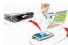
Electronic Probe Transmits through pack