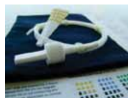
Lot/Batch Control PCD