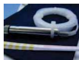
Bowie & Dick Stainless Steel