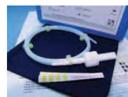
Bowie & Dick PCD